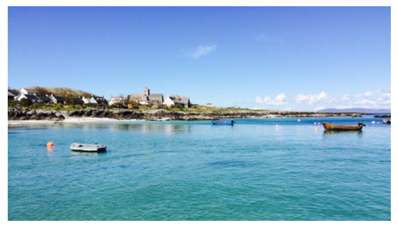
View of Iona village

This parish lies amidst the beautiful physical environment of the Inner Hebrides. The area has an extraordinary cultural heritage, including the historical legacy of the Isle of Iona which is globally famous as the birthplace of Christianity in Scotland and the burial place of more than 50 kings and queens. Both Iona and Mull continue to be places of pilgrimage, attracting hundreds of thousands of visitors from all over the world each year.