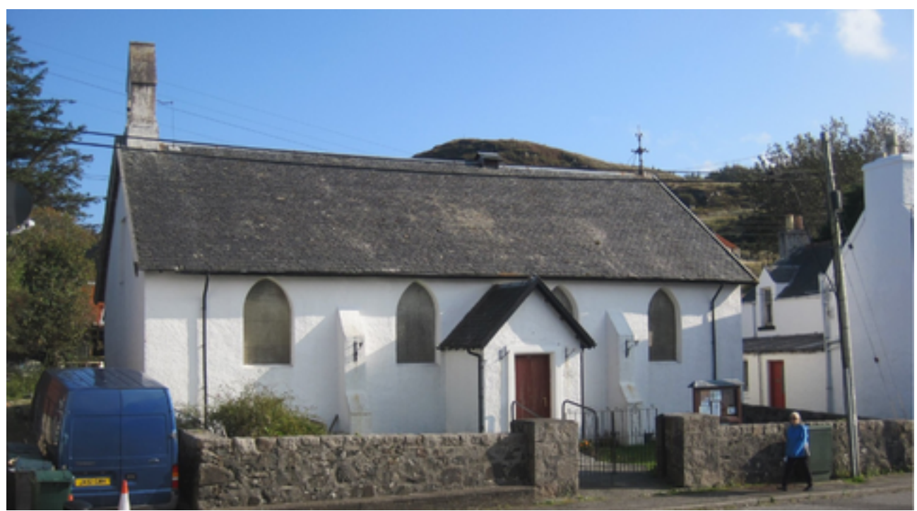
Bunessan Parish Church

funeral load is not heavy - 3 in the last year. We have weddings both of local people and of visitors. On Iona prior permission of Historic Scotland must be obtained to be married in the Abbey Church or ancillary buildings. This does not, of course, apply to weddings in the parish church on Iona. Elderly care provides an opportunity for pastoral ministry and a number of elderly people are cared for in the community by family and carers. There is a small cottage hospital in Craignure and a general hospital in Oban.