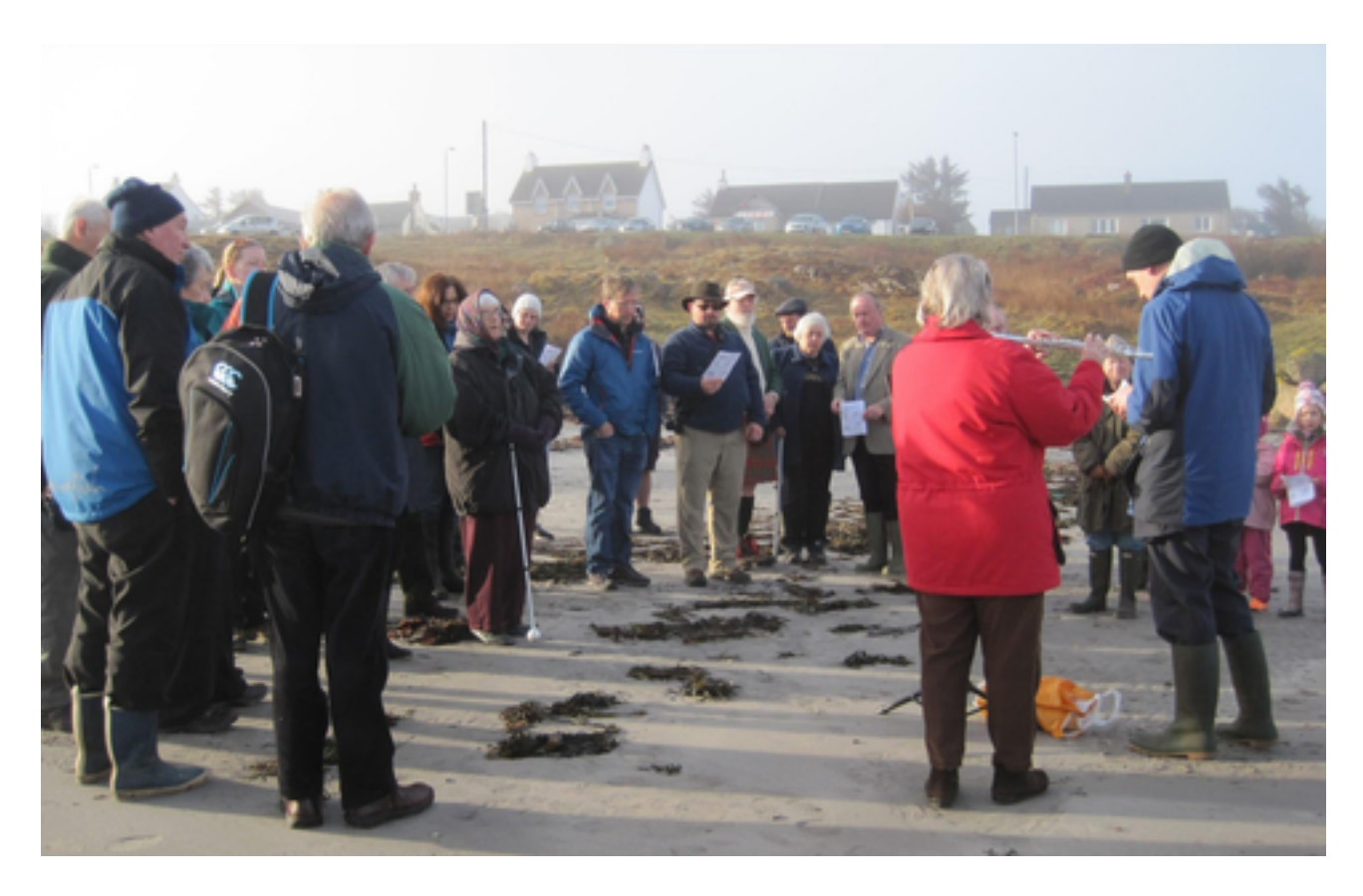
Easter Service at the Split Rock, Fionnphort Beach

Kilfinichen and Kilvickeon places of worship are not in use today, but there are ruins of Kilvickeon situated about two miles SE of Bunessan. This building is contemporary with the nunnery buildings on Iona and constructed in the same style, including the presence of the strange 'Sheela na gig' figure built into the wall of the church.